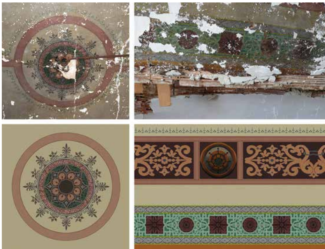
Figure 14: Chernivtsi. Chevra Tehilim Synagogue. Digital reconstruction of the damaged ceiling paintings. Computer graphics by Eugeny Kotlyar, 2015

Old and modern photographs of synagogue wall and ceiling paintings, along with studies, hypotheses and reconstructions, provide excellent material and a set of instruments for displaying this heritage in appealing exhibitions that can be creative, academic or educational. The only instance of this in Ukraine to date has been the project How Goodly Are Thy Tents, Oh Jacob... Synagogue Wall Paintings from Bukovina , which ran in 2015–16 and was curated by the present author in cooperation with the Chernivtsi Museum of Jewish History and Culture in Bukovina (project leader Mykola Kushnir), with research support provided by the leading Israeli specialists Prof. Ilia Rodov (Bar-Ilan University) and Dr Vladimir Levin (Center for Jewish Art at the Hebrew University of Jerusalem).