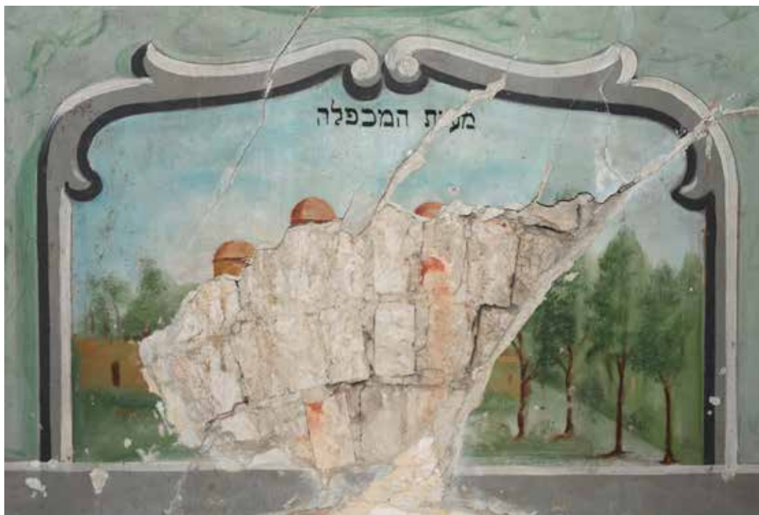
Figure 9: Novoselitsa. New Great Synagogue. The Tomb of the Patriarchs in Hebron, wall paintings, 1919–1920.

pinene and plant oil, thus recovering the images' original vividness. The work was performed in a professional manner, and achieved its goal. But the outcome was that the paintings were left exposed, whereas previously the uppermost layer of chalk had, for many decades, protected them from destruction. Debates and discussions about putting the ensemble on display in the future have not yielded any conclusive results. One of the options, proposed by the private owner of the building, was to conserve the paintings in the same building, which was intended to serve as a cultural institution after renovation. A second option, put forth by Jewish agencies, was to transfer the stratum with the paintings to Chernivtsi, the regional capital, which has an active Jewish community and a museum – in fact, a variety of institutions generating a “museum-going stream” of visitors. Settling on a solution involves tackling questions of an organizational, financial and technical nature which apparently still remain open. Today, thanks to the dilapidation of the building, the paintings are in a critical condition; some of the fragments have been lost forever (Figures 8, 9). The building's owner, concerned about the prolonged inaction, has meanwhile started renovation work on his property on his own. At present it is difficult to guess what this monument's fate may be.