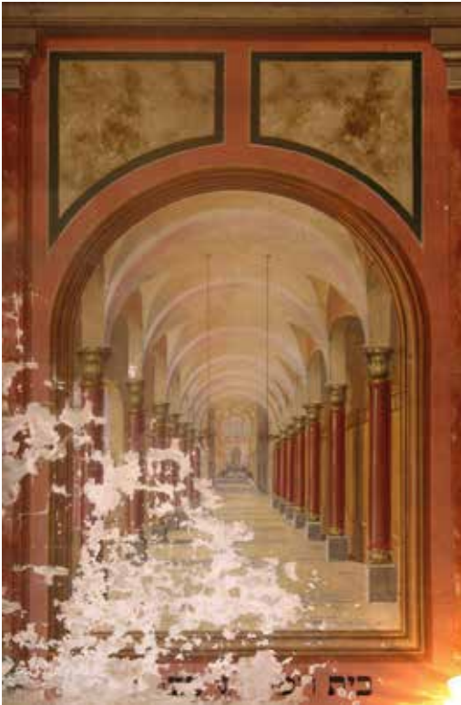
Figure 6: Lvin. Tzori Gilead Synagogue. Wall paintings, 1930s.