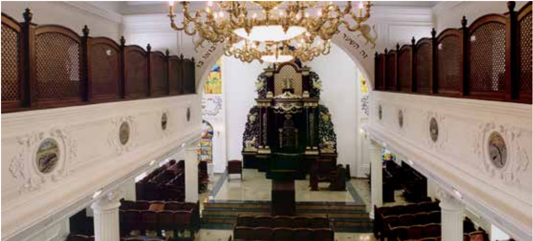
Figure 5: Kyiv. Scheekovitzka (Podol) Synagogue, 1895. Wall paintings, mid-twentieth century. Refurbished in 2002.