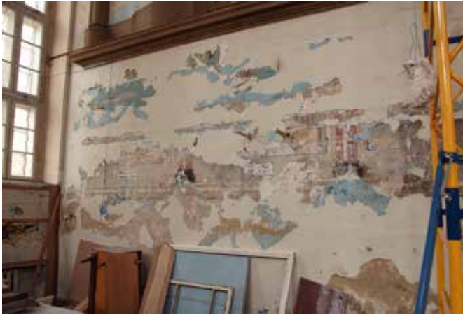
Figure 17: Lviv. Yakub Glanzer's Shul Synagogue, 1844. Traces of wall-paintings in the ruined building. Photo by Eugeny Kotlyar, 2016

Tzori Gilead Synagogue in Lviv, described above. Despite the recent loss of the original and the fact that the paintings had to be entirely redone in 2006–2007, we can confidently make some claims about its programme, iconography and artistic style. The paintings were created in 1936 by the artist Maksimilian Kugel, a member of the workshop circle associated with the Flack brothers. These masters painted