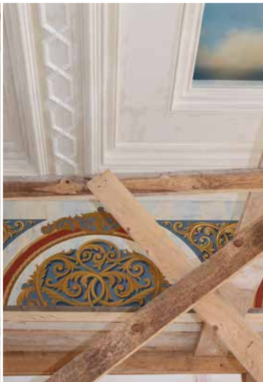
Figure 11: Sadygora (now part of Chernivtsi). Rabbi Israel Friedmann's Synagogue. A new synagogue decoration. Photo by Eugeny Kotlyar, 2016

the question of restoring the centre of Sadygora Hasidism for pilgrims who are also followers of the movement. 31 The very meagre material that remained for the renovators to draw on from the former luxuriously decorated synagogue of one of the most powerful nineteenth-century Hasidic tzaddiks meant it was only possible to form only an overall sense of the styles and the colour schemes used in the decorative wall paintings, and to take in little more than the spirit of the ornamentation. Fragments of painted engaged frames and curved ribbon-like shafts with their inner fields partly filled with climbing acanthus were adopted as basic motifs from the old decoration in creating the new paintings. This part of the decoration, reconstructed from the legacy of the past, also dictated the general colour scheme (Figures 10, 11). The scheme was thoroughly integrated into the new design of the interior of the interior, which combined traditional elements with postmodernism. Aharon Ostraikher, mentioned above in connection with the restoration of Schekovitzka Synagogue, used the motif of a blue sky with clouds, executed in a photorealistic manner, to decorate the coffered ceiling. This modern approach was combined with traditionalist stained-glass windows on the theme of the Twelve Tribes of Israel by the Chernivtsi artist Anatoly Fedirko.