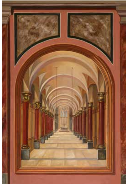
Figure 7: Lvin. Tzori Gilead Synagogue. Wall paintings, 1930s. Refurbished the old paintings in 2006.

well-known Lviv master, Maksimilian Kugel. Even though the paintings were damaged during the years of Nazi occupation, and later when the building was used as a storage facility, the losses suffered were not so serious that they ruled out traditional restoration methods – which was, in fact, the approach adopted by the synagogue's decision-makers. 25