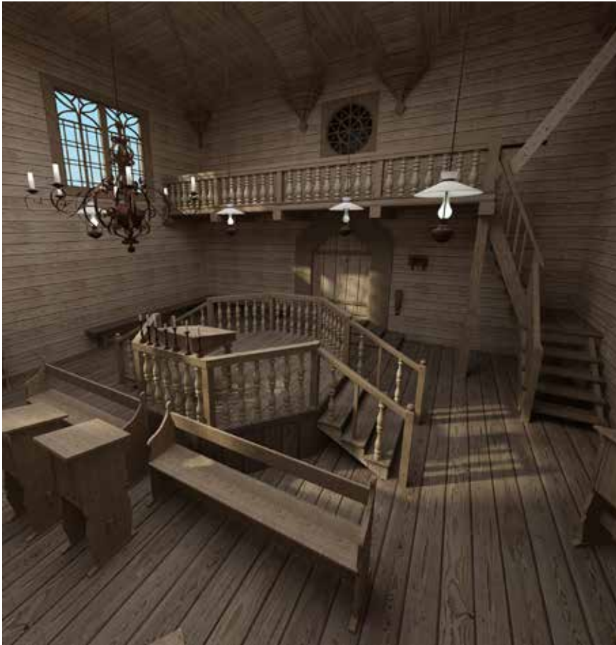
Figure 18: A digitised model of the interior of the wooden synagogue in Smotrych, mid-eighteenth century. Model by Sergey Biryukov and Eugeny Kotlyar, 2011

Jewish context becoming part of the artists' list of thematic foci and creative experience. 42