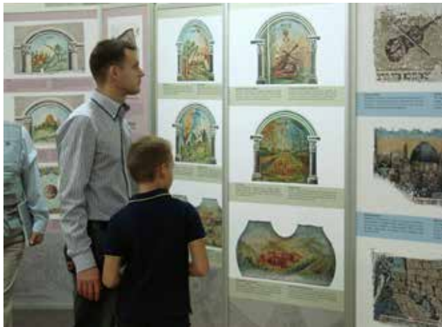
Figure 16: Chernivtsi. The opening of the Wall Paintings in Bukovinan Synagogues exhibition. Art-Sweet Gallery. October 2016.

as in the ruins of Beit Tehilim Synagogue in Chernivtsi, we were able to reconstruct part of a painting that had been all but lost. Certain elements of the painting were recreated based on the surviving details of the ceiling decoration; from this, the original appearance of the painted ceiling re-emerged (Figure 14). Superimposing the lost fragments upon the result produced a photo display which enabled the viewer to envision the ceiling in its original form (Figure 15) and appreciate its condition at present. Similar work on other parts of the paintings enabled us to recreate the painting scheme, except where compositions had been completely lost. The same kind of work was carried out for other synagogues which were in varying states of dilapidation. The result was a comprehensive exhibition catalogue 36 and a transform-