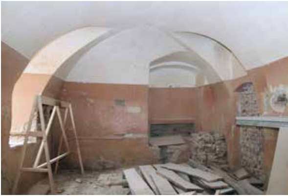
Figure 2: Chernivtsi. The minor hall of the synagogue Groyse Shil. Photo by Eugeny Kotlyar, 2010