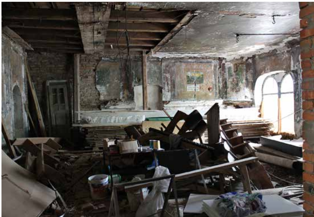
Figure 1: Chernivtsi. Chevra Tehilim Synagogue, turn of twentieth century.

than ten sites where old synagogue wall paintings survive at all. 8 Some of these remaining sites are in deplorable condition and are effectively beyond repair. The Nazi occupation was, unquestionably, the main, though not the only reason for this state of affairs. Ukraine's "achievements" in post-war modernisation saw these buildings stand neglected for decades, without maintenance, or else they were used as warehouses and storage facilities, leading to all the associated problems one might expect with moisture and fungus. The wall paintings here were gradually being destroyed by time. It may seem bizarre today, but other than a few researchers, well-informed connoisseurs and tourists (most of them foreigners), few people entertained the notion that these items were rare surviving memorials of Jewish spiritual culture and art – the fragments of the once high-powered phenomenon of synagogue decoration.