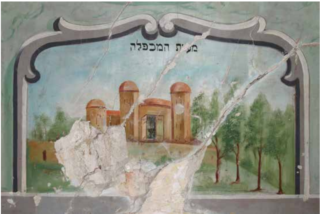
Figure 8: Novoselitsa. New Great Synagogue. The Tomb of the Patriarchs in Hebron: wall paintings, 1919–1920. Discovered in 2009.

The only example of this approach is the case of the paintings in the abandoned Novoselitsa synagogue, which were discovered under the whitewash in 2008 and made fully visible a year later by Kyiv renovators. 30 The purpose of clearing away the most recent layers of plaster from the painting stratum was the desire to make the unique find, miraculously preserved, visible as soon as possible. Following the cleaning, the paintings were uncovered using a solution of