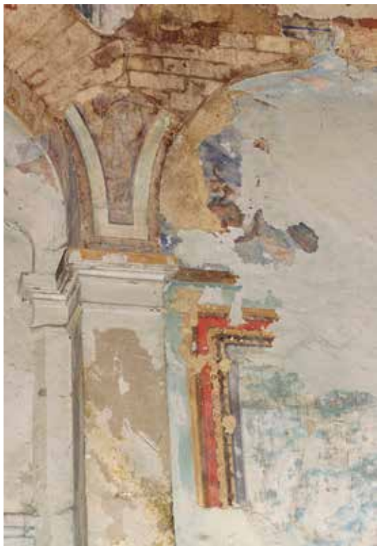
Figure 10: Sadygora (now part of Chernivtsi). Former Rabbi Israel Friedmann's Synagogue. Traces of wall-paintings in the ruined building. Photo by Eugeny Kotlyar, 2002