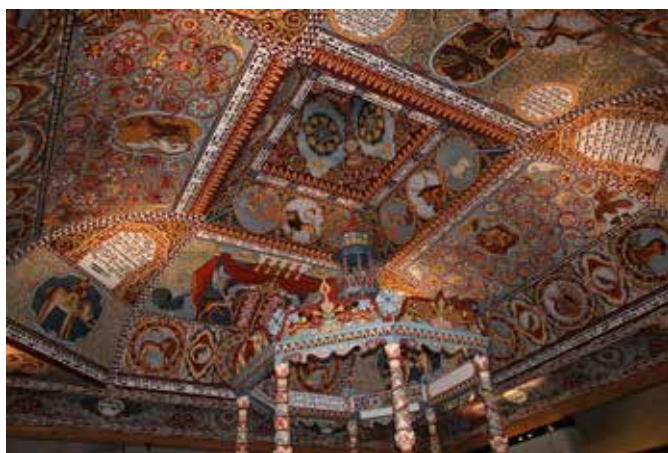
Figure 12: Replica of the bimah and vault paintings from Gvizdetz Synagogue. Warsaw: POLIN Museum of the History of Polish Jews. 2013–2014.

This approach can be traced in two well-known copies of synagogue wall paintings from the first half of the eighteenth century, recreated using wooden constructs. These are replicas of the ceiling paintings from the Khodoriv Synagogue (1977, James Gardner Studios, London) stored in the Diaspora Museum in Tel Aviv, and the vault and bimah paintings from Gvizdetz (2011–2014, Handshouse Studio, Norwell, US) 32 at the POLIN Museum of the History of Polish Jews in Warsaw (Figure 12). 33 Both synagogues were formerly located in