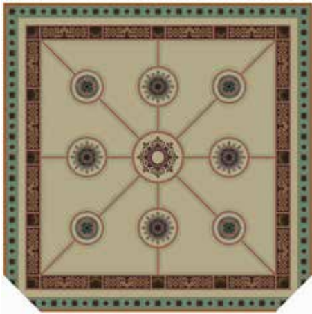
Figure 15: Chernivtsi. Chevra Tehilim Synagogue. Digital reconstruction of the ceiling paintings. Computer graphics by Eugeny Kotlyar, 2015