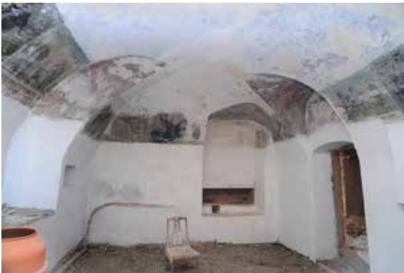
Figure 3: Chernivtsi. The minor hall of the synagogue Groyse Shil. Wall paintings, late 1930s. Discovered in 2013. Photo by Anna Yamchuk, 2015

the paintings (which could be the name of the artist or the donor) is Fishman. 14 Recent research by Boris Khaimovich indicates that the synagogue was painted by a certain master, Groyzgrow from Khotin, in the traditions of the “regional canon” of Boyan Hasidism. 15 This surviving building features an especially extensive series of late Eastern European synagogue paintings, enabling us to trace the spread of this iconographic system among the synagogues of Northern Bukovina.